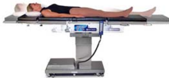
350I EZ SLIDE