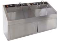
SCRUB SINKS & STAINLESS STEEL STORAGE