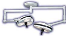
OUTPATIENT, PROCEDURE & EXAM ROOM LIGHTS