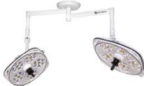
AURORA LED LIGHTS