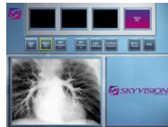
SKYVISION OR INTEGRATION