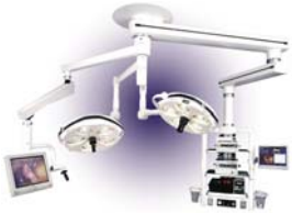
INTEGRATED OPERATING ROOMS