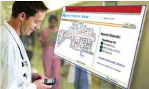
SAM-SKYTRON ASSET MANAGER RFID ASSET MANAGEMENT TECHNOLOGY