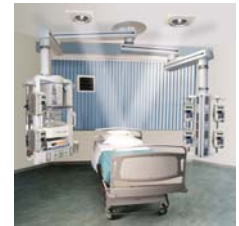
AR24 ARGOS LIGHTS FOR CATH LABS, ICU AND L&D