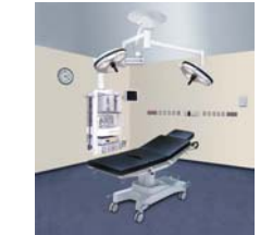
EMERGENCY ROOM LIGHTS & BOOM